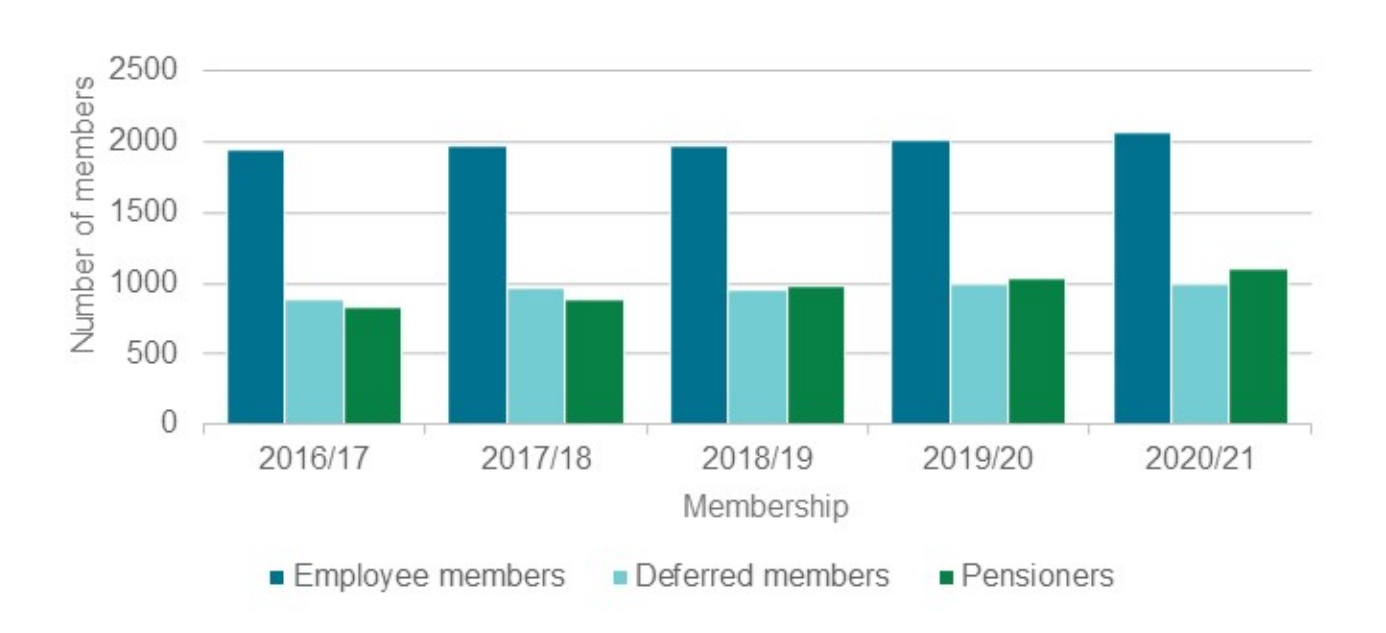
Exhibit 3 Orkney Islands Council Fund Membership