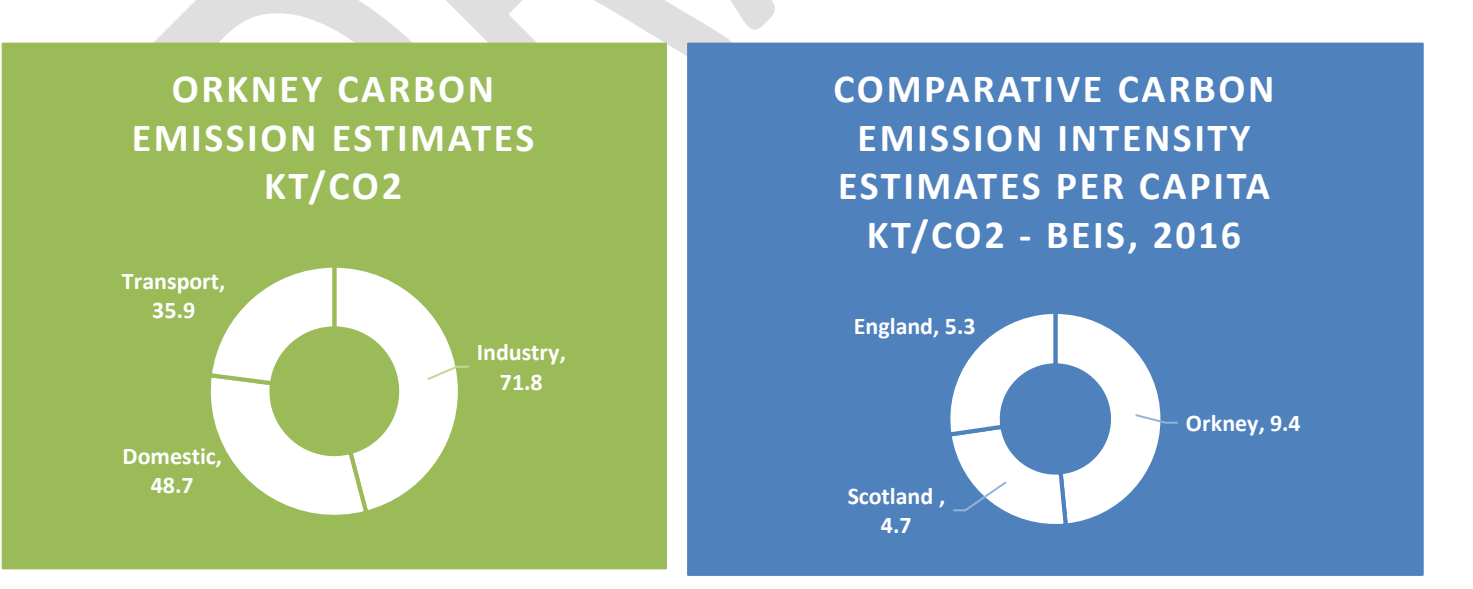
Figure 1. Orkney Carbon Emission Estimated by sector, Kt/CO2 and Orkney's comparative carbon emissions figures with Rest of UK average, per head of population – Source: BEIS, 2016.

Although Orkney generates much of its local electricity demand from renewable sources there are periods of import from the wider UK network and as such Orkney's electricity generation is broadly classified along the same lines as the rest of the UK giving a carbon density of 0.30720 kg CO<sub>2</sub>e / kWh.