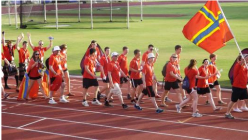
Team Orkney in Bermuda - 2013