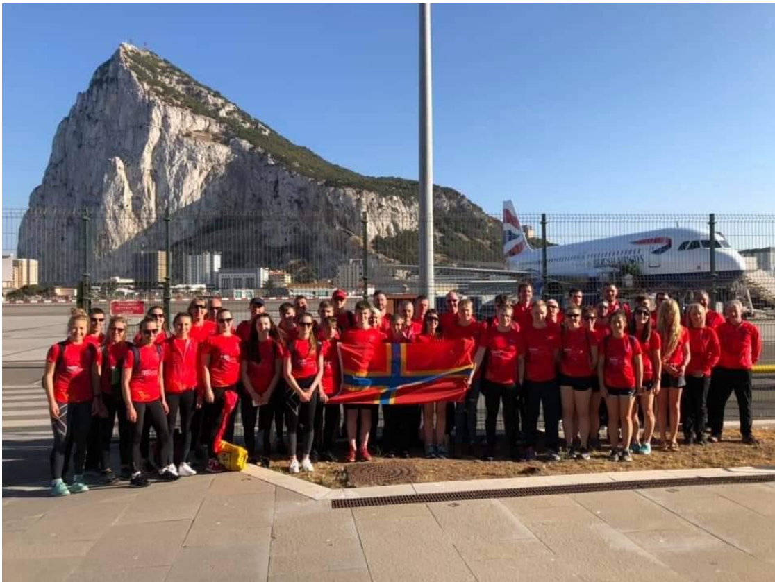
In front of the famous Rock of Gibraltar – Team Orkney’s most recent games in 2019

We would like you to become part of the Team, and enjoy our future success, together.