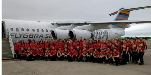
Team Orkney flight to Gotland - 2017