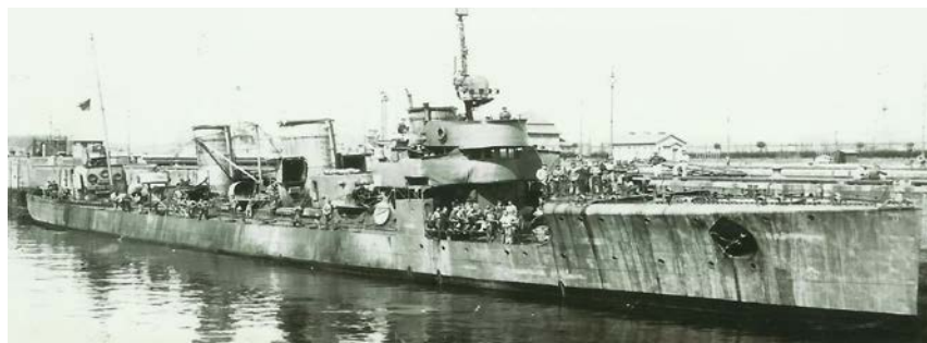
The B-98, used as a mail ship for the interned fleet in Scapa Flow; now lying in the Bay of Lopness.