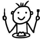
eating nice food