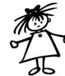
being left alone