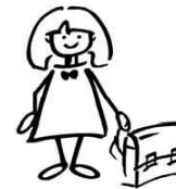
going to school every day