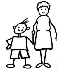
spending time with family