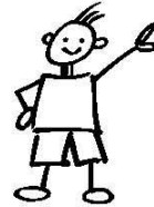
having clean clothes