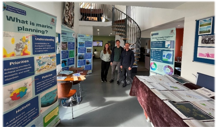
The team ready to welcome 50 people at Heilsa Fjold - Sanday

It has been a very busy summer for OIC Marine Planning. Having received approval from Scottish Ministers to begin the consultation on the Orkney Islands Regional Marine Plan, the Marine Planning Team have organised and been delivering the formal public consultation. This is the consultation for both the Regional Marine Plan as well as the Orkney Islands Marine Region: Finfish Farming Spatial Guidance .