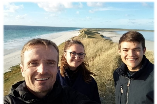
The Marine Planning Team visiting Cata Sands and Tresness whilst waiting for the return ferry, after a successful consultation event

This Autumn 2024 newsletter covers these key developments and more, but as ever if you have any questions or stories you'd like included in future issues, drop us an email on marine.planning@orkney.gov.uk .