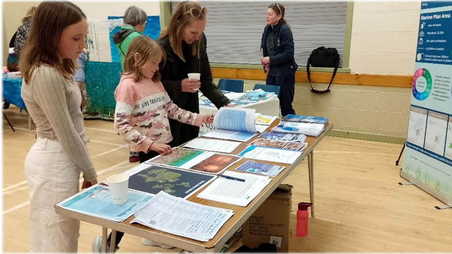
People of all ages have shown an interest in the Regional Marine Plan

The consultation closes on October 25 th . It is not too late to submit your comments, and we would encourage you to do so. Links to the consultation documents are available on the previous page.