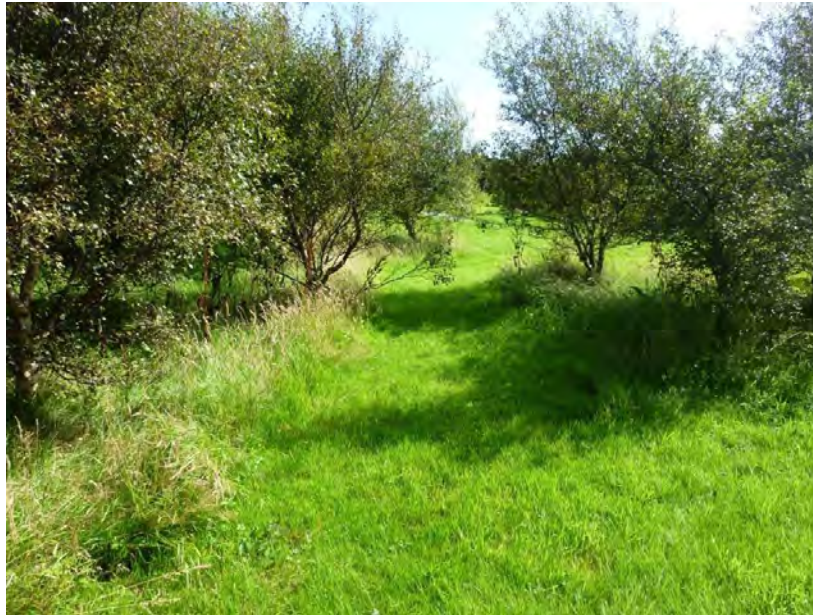
Trees at Muddiesdale, Kirkwall

Towns and smaller settlements include public 'parkland' and grassed areas that are managed and maintained by Orkney Islands Council (OIC). These areas have largely been designed and maintained without thought as to how they could contribute to biodiversity objectives.