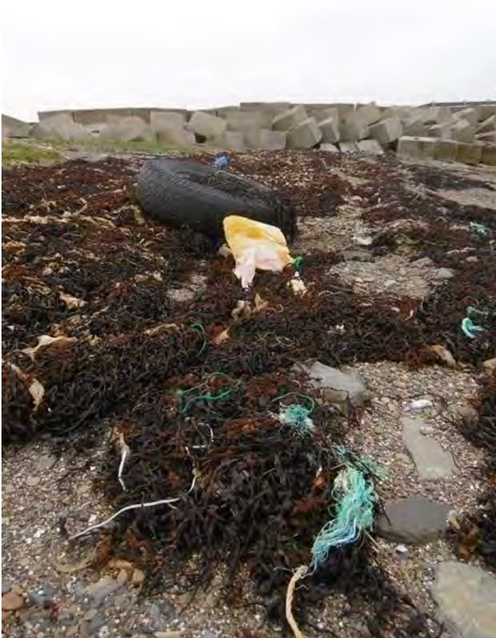
Marine Litter at No. 1 barrier

Plastic waste accounts for a large percentage of marine litter and causes harm to marine life in several ways. It can cause entanglement and drowning, or animals may eat it mistaking it for their usual prey species. Puffins, Fratercula arctica , have been recorded feeding plastic to their chicks.