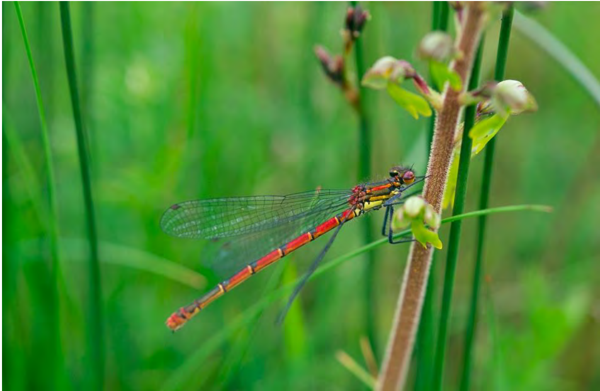
Large Red Damselfly

Keynote species: Hen harrier, Circus cyaneus ; Short-eared owl, Asio flammeus ; Golden plover, Pluvialis apricaria ; Red-throated diver, Gavia stellata , Large heath butterfly, Coenonympha tullia ; Heath carder bee, Bombus muscorum , Lichens; Sphagnum mosses; Orchids; Dragonflies and Damselflies.