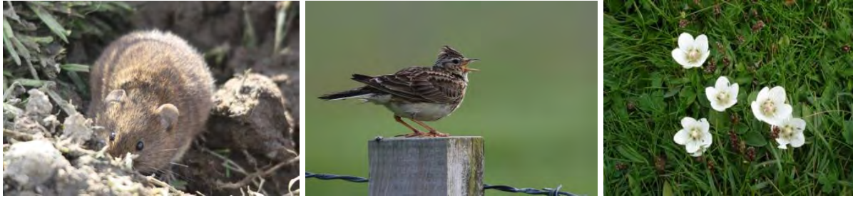
Orkney Vole, Skylark and Grass of Parnassus