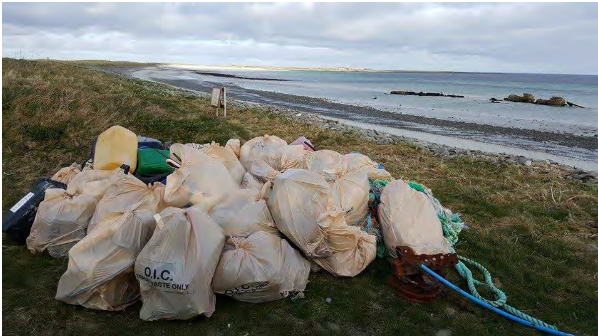
Bag the Bruck waste collected in Sanday

Bag the Bruck is a local clean-up initiative which takes place annually during April. Around 50 beaches and shorelines are targeted by over 1,000 volunteers and over a period of 9 days many tonnes of litter are collected, bagged and removed for disposal. Established in 1993 by Environmental Concern Orkney (ECO), Bag the Bruck is now administered by members of another local group, Outdoor Orkney. The Council lends its support by picking up and disposing of the waste that is collected.