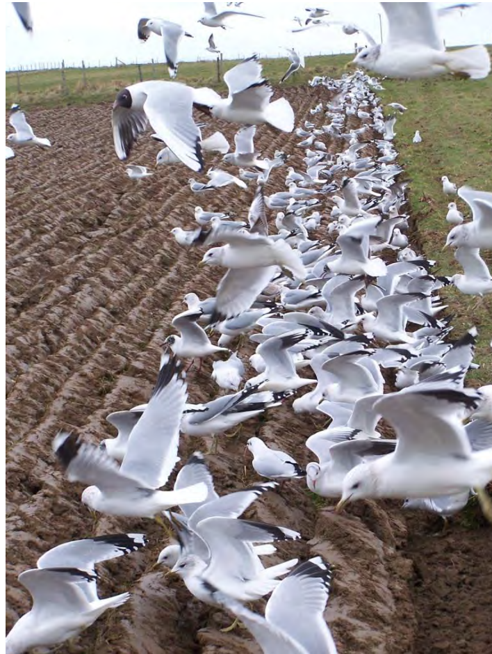
Gulls following the plough

The current SRDP will include at least one more round of AECS applications and five years funding will then be available, going forward. Following the United Kingdom's exit from the European Union, the long-term future of agricultural support payments remains uncertain.