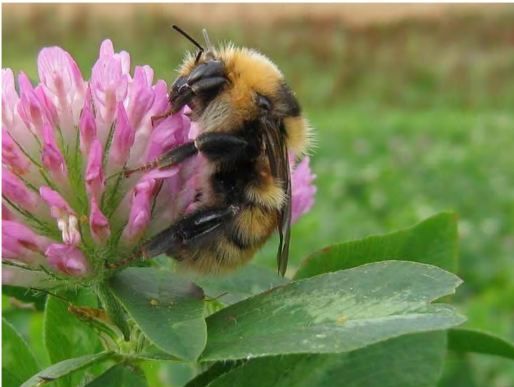
Great Yellow Bumblebee

Destruction of bees' and wasps' nests, whether deliberately or accidentally;