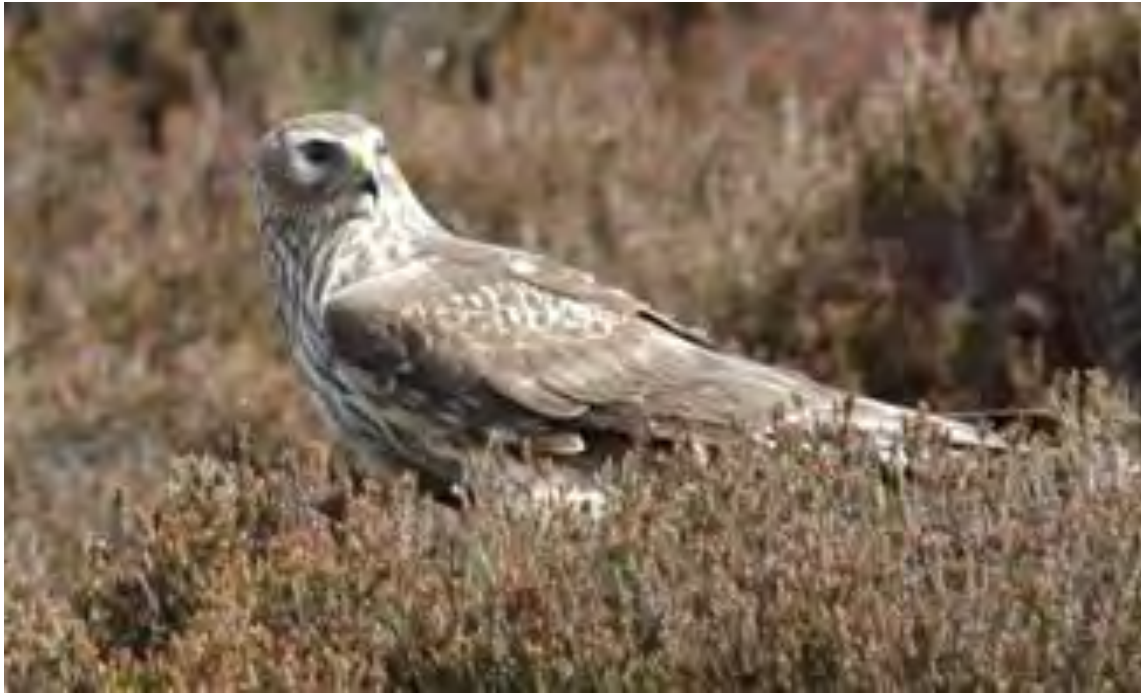
Female Hen Harrier

Orkney is a vital stronghold for Hen harrier, with an estimated 83 breeding pairs in 2016. While Hen harriers are declining in other parts of the UK, the Orkney population is remaining stable.