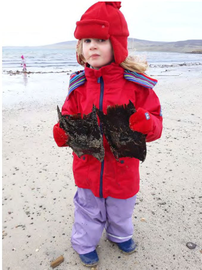
Egg Cases found in Evie