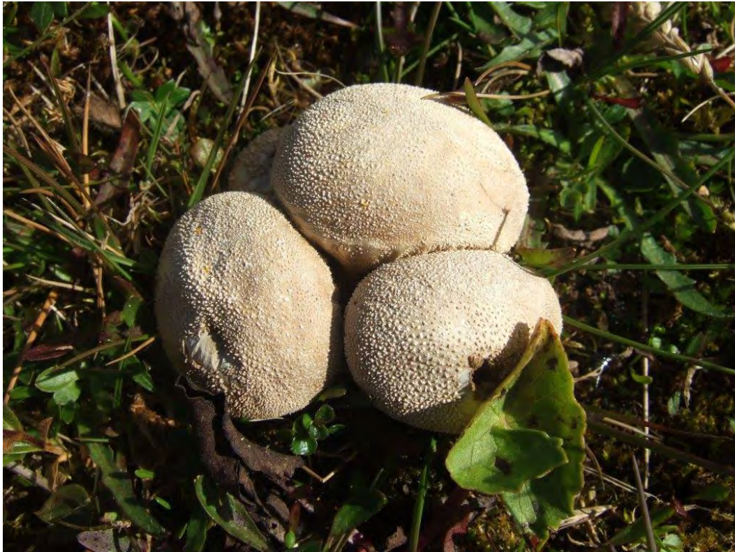
Puffballs

The Orkney Wildlife Information and Records Centre is based in the Orkney Library and Archive, on Kirkwall's Junction Road and provides vital support for biodiversity action planning. Established in 1998, the Centre provides a repository for the collection and dissemination of information relating to Orkney's natural heritage. Data on the County's habitats and species has been recorded over many years, both by voluntary recorders and by other organisations with an interest in the natural environment of Orkney.