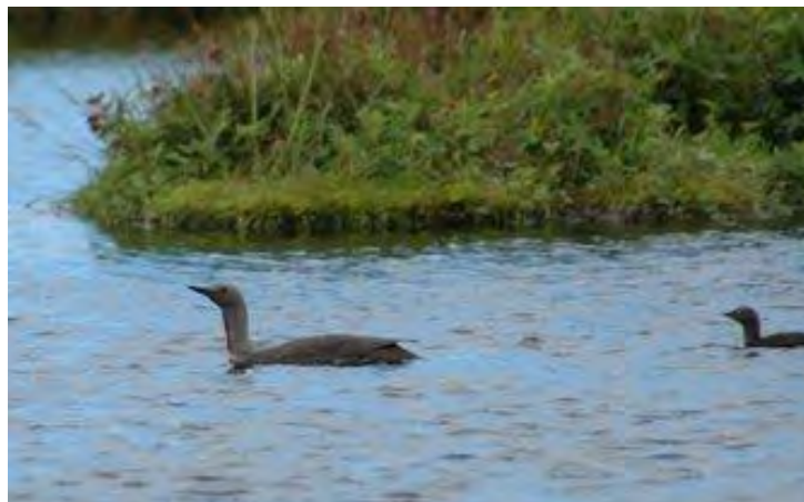
Red-throated Diver

Key features of Orkney's bog landscape are the many bog pools and lochans which provide nesting sites for Red-throated diver, Gavia stellata and also support a number of dragonfly and damselfly species.