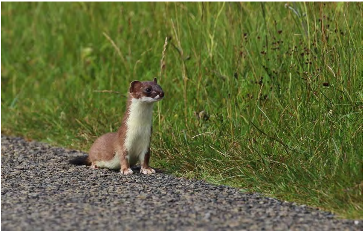
A Stoat in Orkney

In 2014 Scottish Natural Heritage (SNH) commissioned a report 4 , to consider the possible effects of the stoat population on Orkney's native species. The report recommended that removal of the stoat population is the best option to safeguard Orkney's wildlife. As a result, the Orkney Native Wildlife Project (ONWP) has been established, led in partnership by SNH and the Royal Society for the Protection of Birds Scotland (RSPB), and with the generous support of the National Lottery through the Heritage Lottery Fund. In 2017 Orkney Islands Council (OIC) agreed to be a non-financially contributing partner.