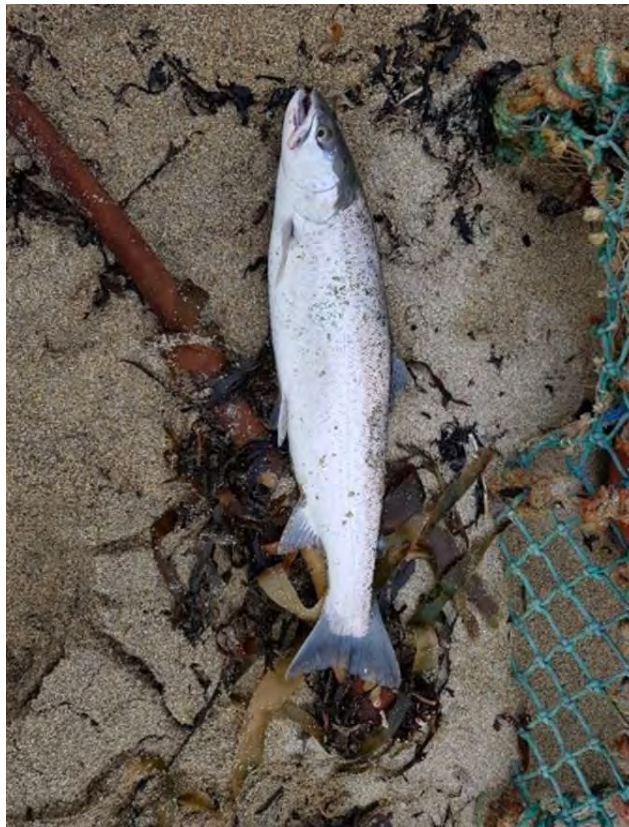
Sea Trout

The Sea trout, Salmo trutta , is an anadromous species, i.e. fish are born in freshwater, then migrate to the sea as juveniles where they grow into adults before migrating back to freshwater to spawn. It is the migratory form of the fresh water Brown trout. In the British Isles this species can grow up to about 1m in length and over 10kg in weight; however individual sizes vary widely between populations. As juvenile fish, they are characterised by the presence of red or orange spots on their flank, mostly above the lateral line. Those fish destined to become Sea trout change their colouration to silver as they prepare for downstream migration and during spring they enter the sea as silvery smolts. Some of these return to spawn in fresh water as mature adults between May and November of their first year at sea, whilst others return to overwinter in fresh water as juveniles, also known as 'finnock', and may not spawn at this time. These fish return to the sea, coming back to the burns to spawn in subsequent years. Spawning occurs in late autumn and many Sea trout will spawn several times during their lifetime. On their return to the rivers and burns they gradually darken to a reddish brown and male fish develop a hook or 'kype' on their lower jaws.