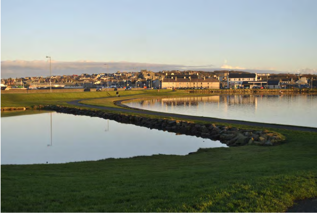
The Peedie Sea, Kirkwall

Further information on this habitat and the species it supports is included in the Built-up areas and gardens Habitat Action Plan (HAP) in the original Orkney LBAP (2002) which is available on the Council's website.