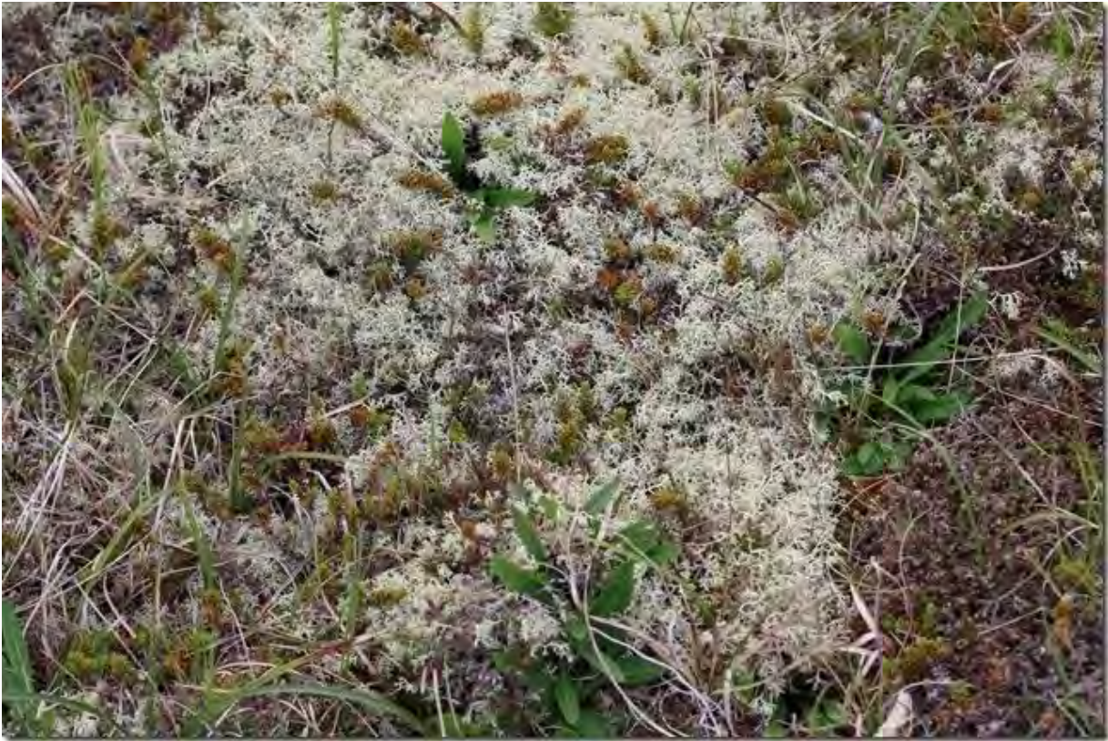
Lichen in heathland

bryophyte interest. Nitrogen deposition can increase the likelihood of insect defoliation of upland heathland.