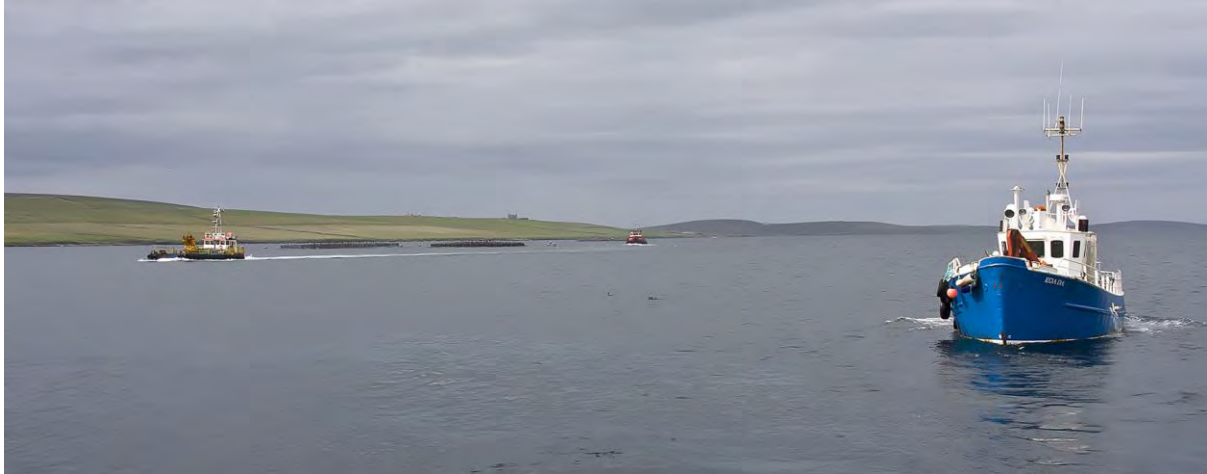
Fish Farm and other Marine activity

Increasing numbers of people work in Orkney's marine environment, e.g. in the inshore fishing, aquaculture and marine renewables industries, and they are well placed to record sightings of marine species and their behavioural traits.