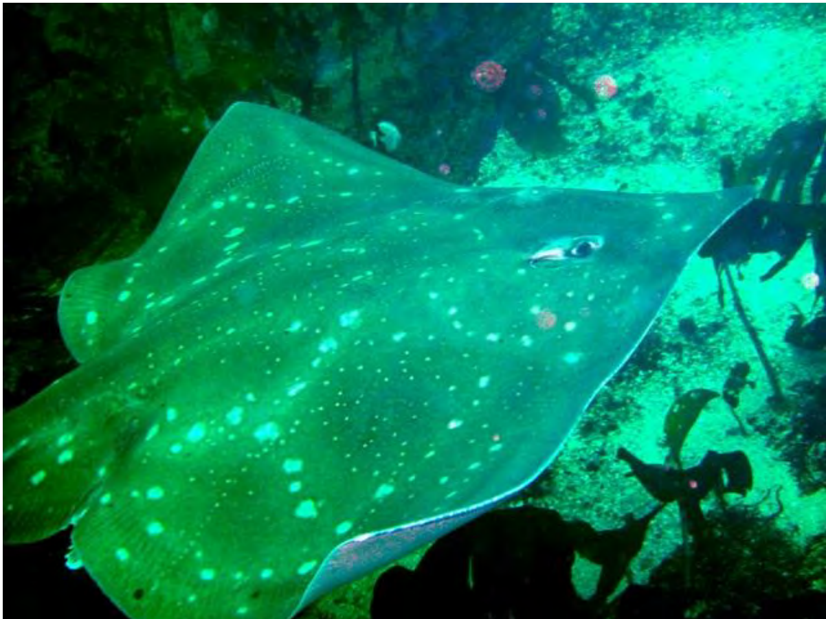
Flapper Skate

The Flapper skate is the largest skate in European waters and can grow up to 3m in length. It has a long, pointed snout and its upper side is brownish green with lighter spots (although not all specimens have these). There is a row of 12-18 thorns along the tail. Young skate have a black underside which fades to paler grey or cream as the fish ages. The pelvic fins in males are modified to create claspers for the transfer of sperm. Like sharks, the skate is an elasmobranch (a cartilaginous fish) and has no swim bladder; instead the fish maintains buoyancy with large livers, rich in oil.