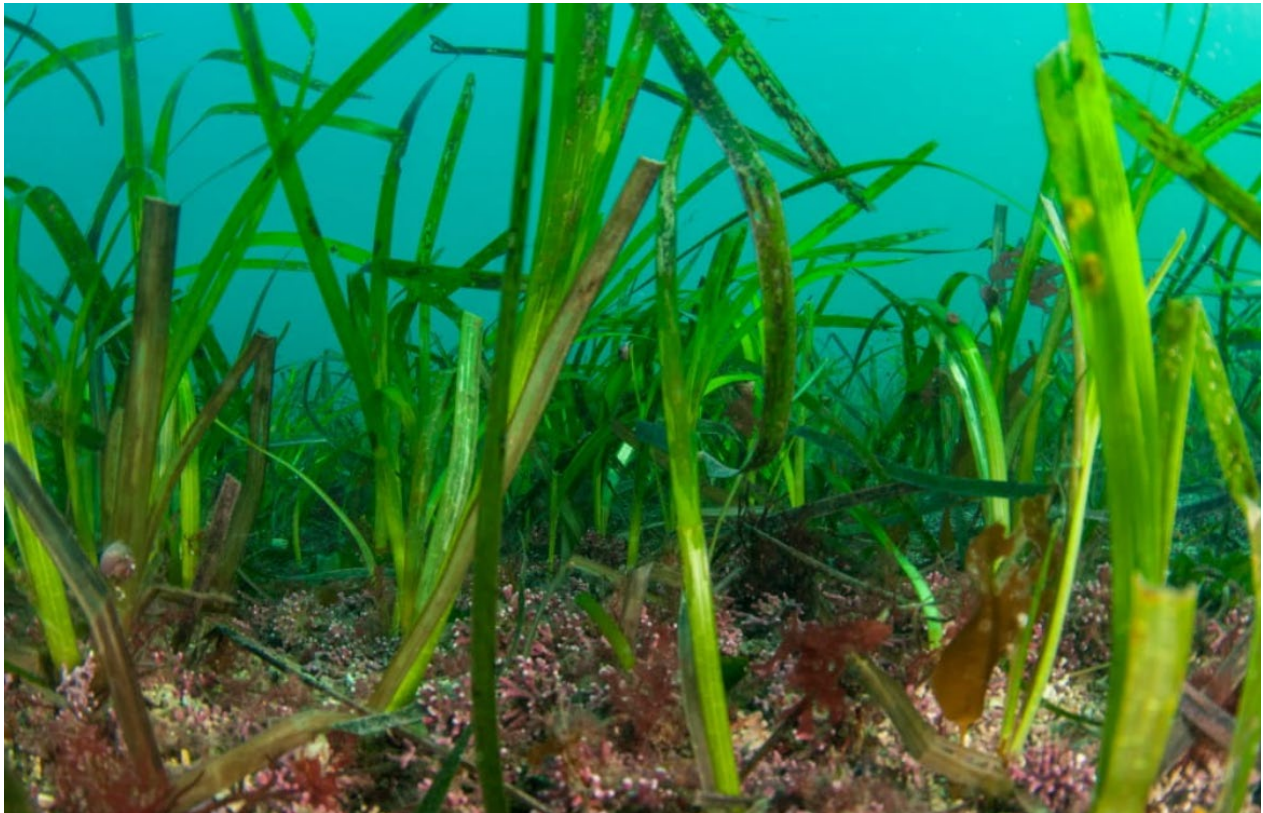
Orkney Seagrass bed with maerl.

Website: Marine Planning (orkney.gov.uk)